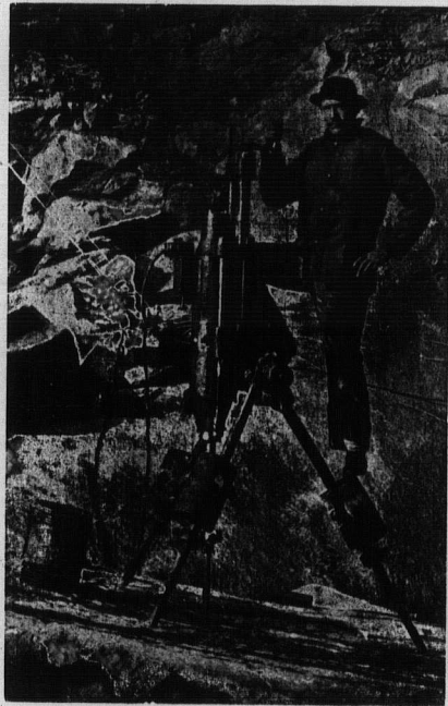
Van Depoele Electric Drill.