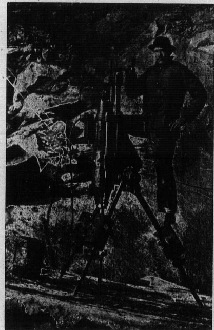
Van Depoele Electric Drill.