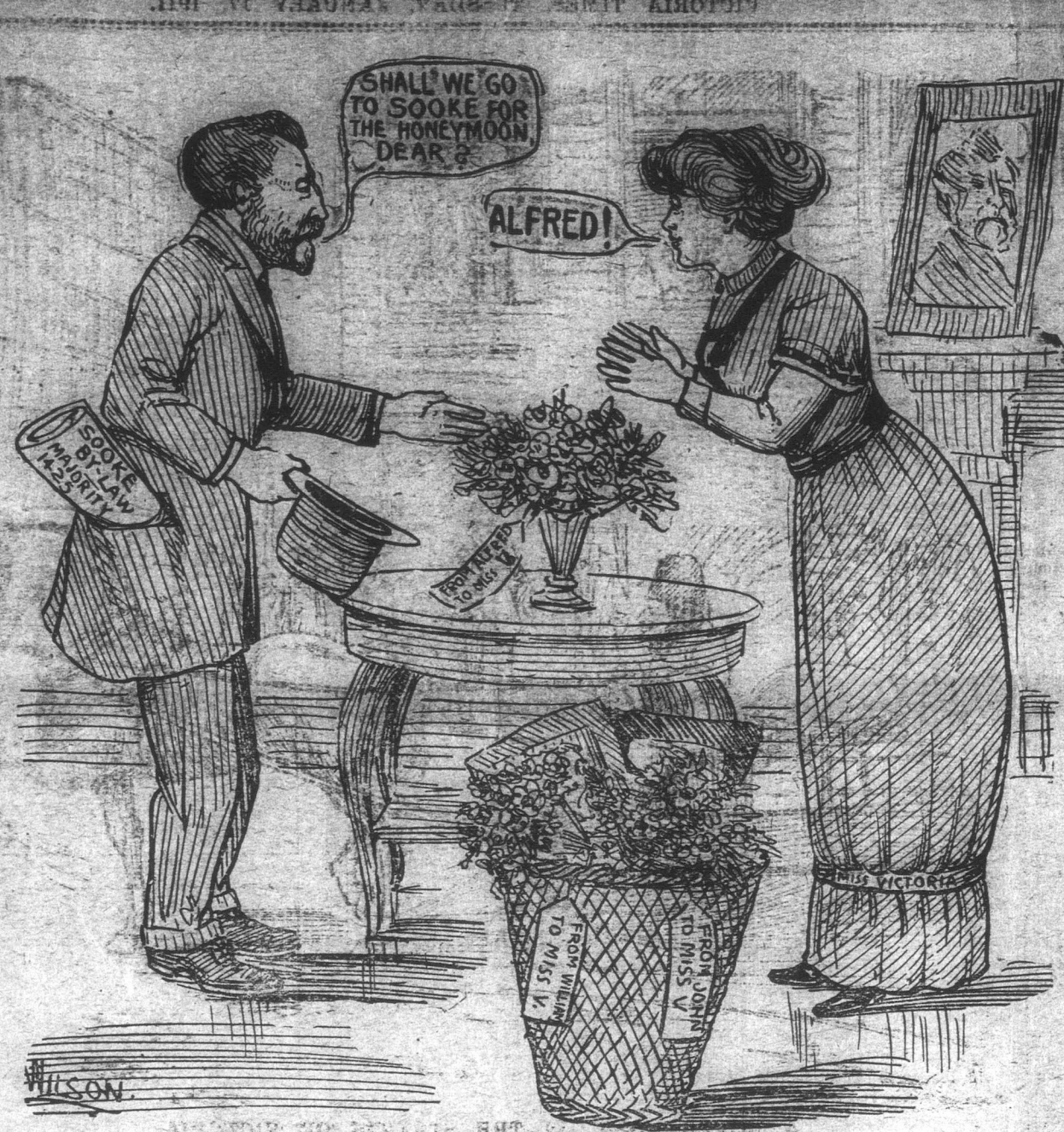
THE FORTUNATE SUITOR.

Legislative Press Gallery, Jan. 12. "One of the first comments made today by those who have seen many openings of the legislature was that it was not attended by as many of the public as is customary. This is probably to be accounted for by another unique feature of the occasion, that for the first time in the history of the local house the opening ceremonies took place under lowering skies and with a thick carpet of snow on the ground. It was the first "white" opening of the province's legislative body has seen."