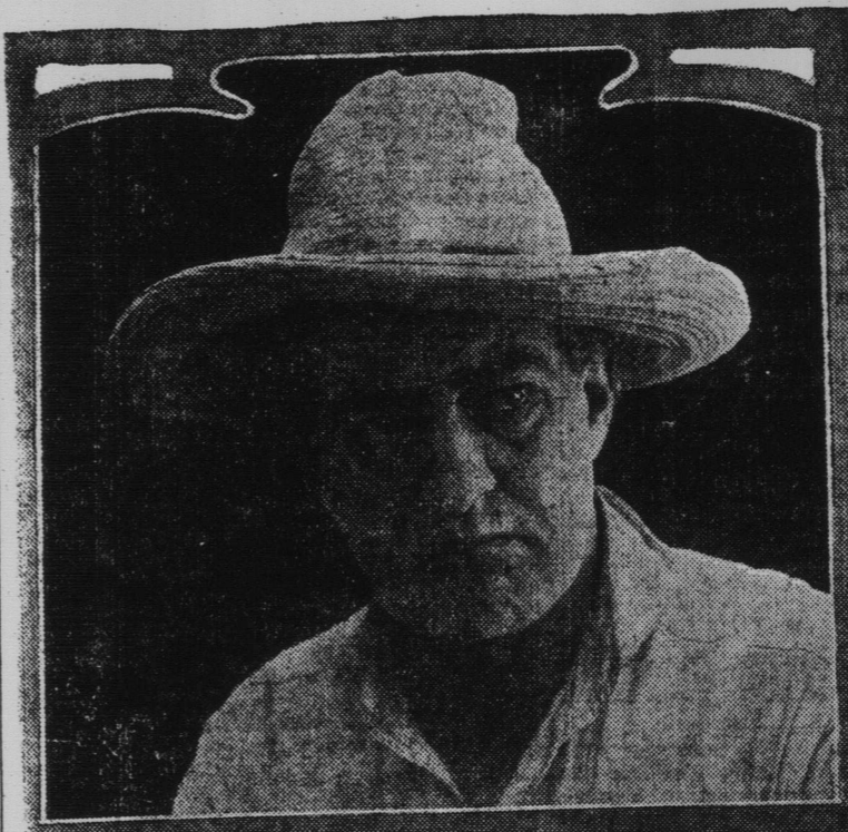
Tyrone Power, Star in "The Planter," Mutual's Seven-Reel Spectacle.