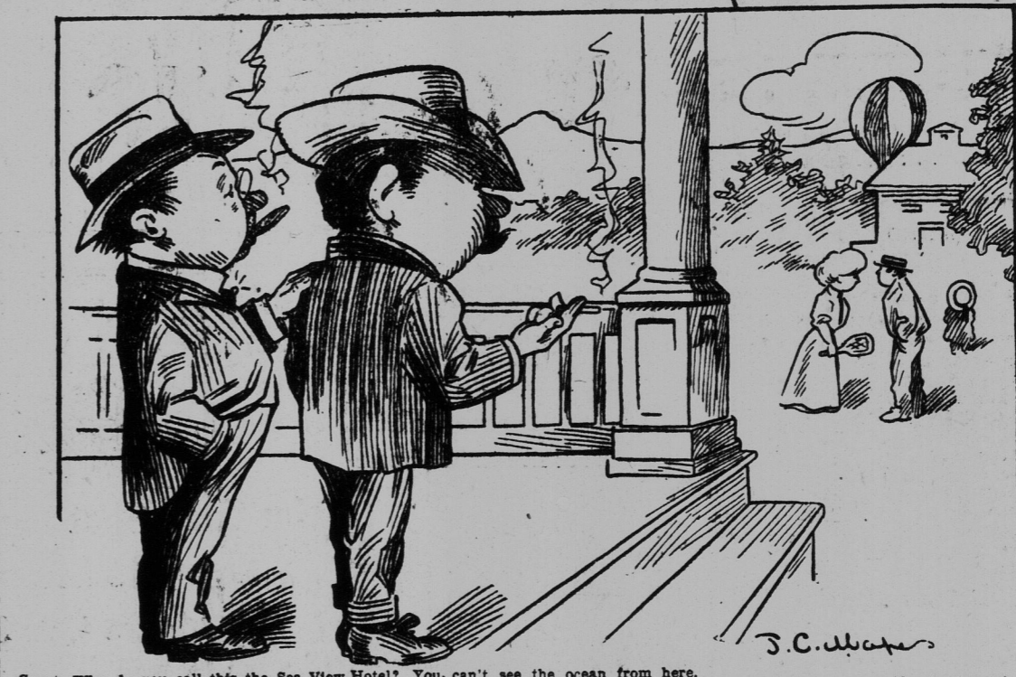
Guest—Why do you call this the Sea View Hotel? You can't see the ocean from here. Proprietor—Oh, yes you can. We have a captive balloon that goes up five hundred feet. You get a magnificent view of the sea from there.

Hartland, N. B., July 27.—(Special)—Lorne McNally, accused of being implicated in the recent case of incendiarism, was further examined today and remanded for one week.