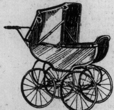
And a Noteworthy Special in Doll's Carriages, as Illustrated, $3.00

"Oh, buy me one with a hood!" said a little girl. "All the other girls' carriages have hoods on." So here's a chance to fulfil her heart's desire, and practise economy! The carriages are as illustrated, with wood body, leatherette hood, seven-inch rubber-tire wheels, strong springs, and finished in black throughout. Very specially priced, $3.00. —Basement, Albert St.