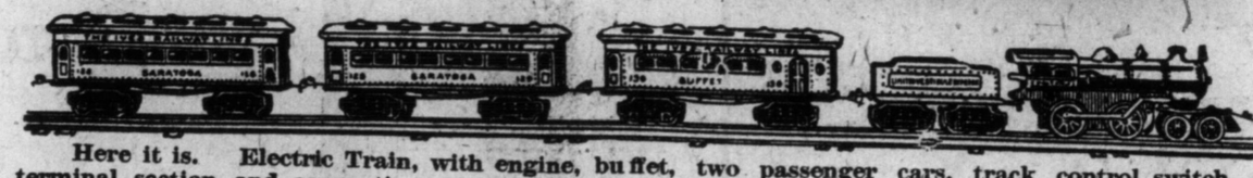
Here it is. Electric Train, with engine, buffet, two passenger cars, track control switch, terminal section and connecting wires. Complete, $16.00.

Here's a lovely big Teddy, indeed; two feet high, with jointed arms, and a nice, kind face. You may have him in brown, light or dark blue shades. Special, today, $2.85.