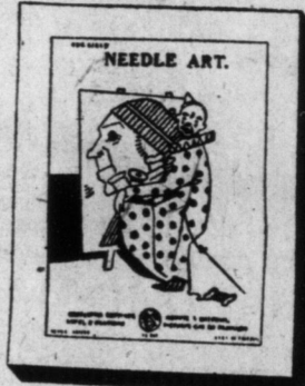
"Needle Art" with outline cards and initials for sewing, 25c.