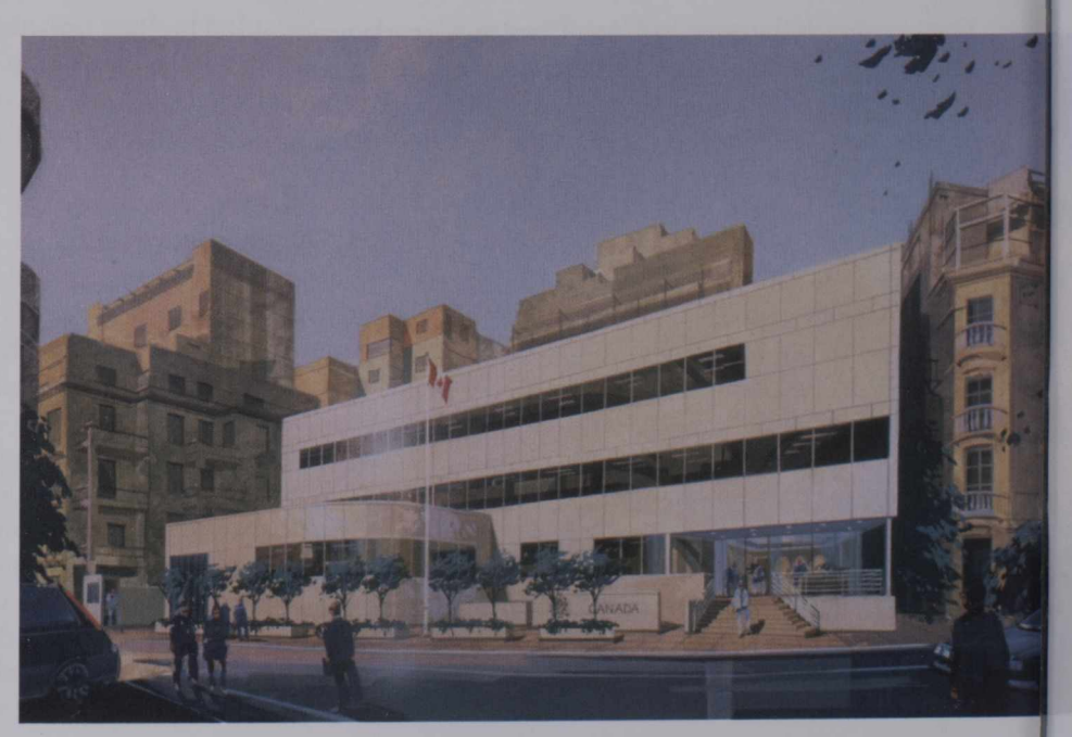
An artist's rendering of the Embassy of Canada to Egypt