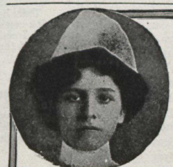
Royal College of Science 709A Spadina Ave., Toronto.

If you have anything to sell to farmers, use a Rural Canada ad. Full information, Rural Canada, Toronto, Canada.