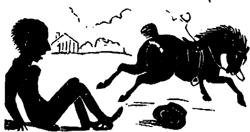
SITUATION WANTED—By a young man, capable of looking after a horse.