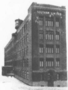
Illustrating our 5-storey MODERN FIRE-PROOF STRUCTURE

GUMMED LABELS. —Our Catalogue No. 100 illustrates and describes our sizing and pricing gummed labels in boxes and in books, and Lawyers' and Notarial Seals.