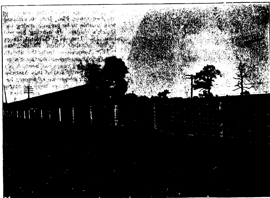
PAGE FENCE ON NEW YORK CENTRAL RY.