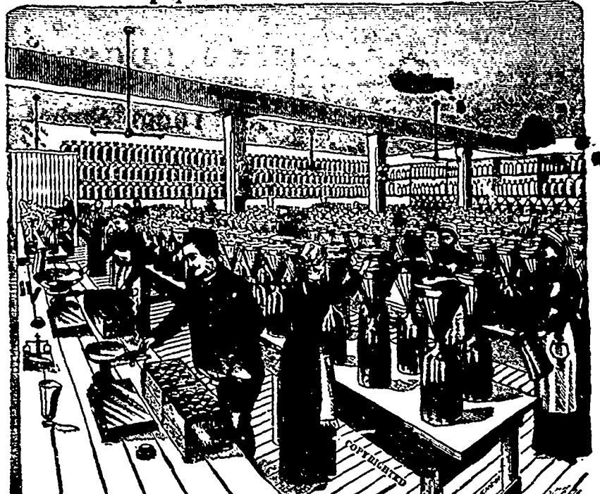
Scene in one of the Departments of the PRICE BAKING POWDER COMPANY'S MANUFACTORY, THE LARGEST IN THE WORLD. Preparing Dr. Price's Special Flavoring Extracts.

Dr. Price's Extracts, Vanilla, Lemon, Orange, Etc., prepared from the true fruits, flavor deliciously.