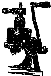
Crank or Balance Wheel.

The Cyphers hatches out a larger percentage of good, strong, healthy chicks than any other incubator on the market. Take the Cyphers machines and don't do as many of our customers have done, bought two or three other makes of incubators and then had to buy the Cyphers from us to hatch chickens with. The Cyphers is a strictly first-class machine in every respect and will last a life time. No moisture required as the machine supplies its own moisture.