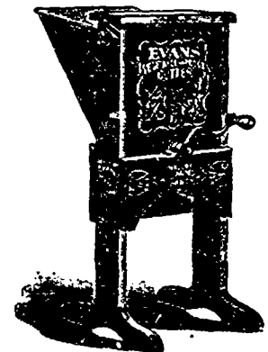
Bone, Vegetable and Root Cutter.

1 quart can.....$ .35 2 quart can.....$ .65 4 " " ..... 1.00 5 gallon " .....All cans free 4.50