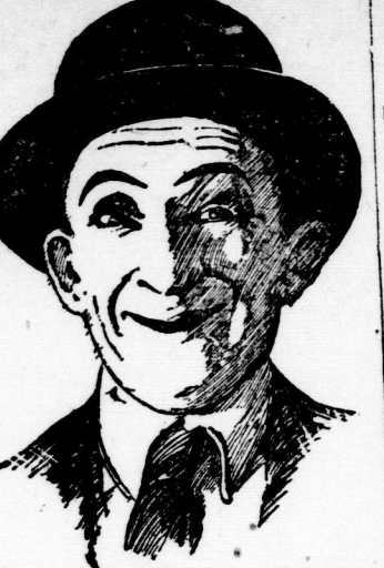
LARRY SEMON, an ace of funsters, appearing in his latest success, "The Hook," at the Grand next Monday, Tuesday and Wednesday.

AT LOEW'S. BIG SPEED CLASSIC SHOWN IN WALLACE REID'S RACE PICTURE. Automobile race enthusiasts will see some of the high spots of the big speed classic which was held at the famous new Beverly Hills speedway near Los Angeles on February 27, 1921, when they see Wallace Reid's Paramount picture, "Too Much Speed," which will be shown at Loew's Theatre for three days beginning next Monday. One of the big features of this picture is the race in which Wallace Reid, in the role of Dusty Rhoades, is supposed to participate, and the big speed match referred to was used as a background for the story. Some of the thrilling moments of the big race were filmed