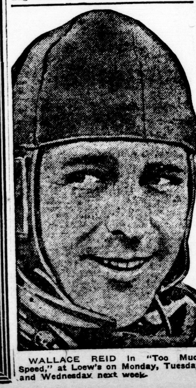
WALLACE REID in "Too Much Speed," at Loew's on Monday, Tuesday and Wednesday next week.