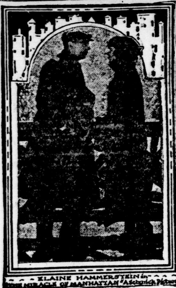
ELAINE HAMMERSTEIN in "The Miracle of Manhattan," at the Grand Thursday, Friday and Saturday.