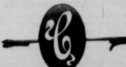
G54. Gold-filled Safety Pin, any initial .....75

THIS IS A REPRODUCTION OF OUR NEW 1916 CATALOGUE. It pictures our diamond and diamond and precious stone rings, and some of our cameo jewellery in actual colors, and a picked selection of our other jewellery, watches, silver, cut glass, brass and leather goods in the finest black and white illustrations. Send for it. Use the coupon opposite.