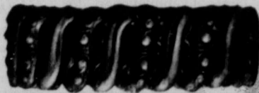
G53. Extension Bracelet of the popular "Lattice" style ..... 3.00