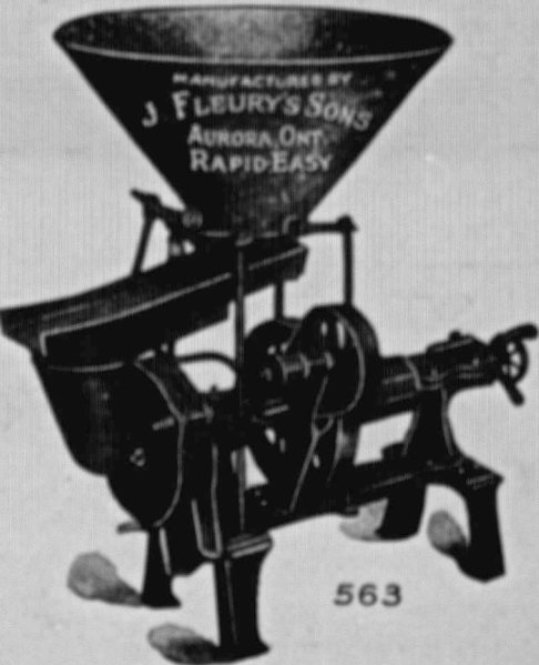
Fleury's "No. 3 Rapid Easy"

with 10-inch plates, and its SOLID FRAME or BED, is not only an extremely handsome looking machine but the character of its work and its great capacity make it one of the best "paying guests" on the farm. Feed trough is long and broad, giving feeding and screening capacity equal to the rapid work of the grinder. Heavy steel shaft with long bearings and heavy balance wheel. Rigid and durable, this machine is especially fitted for fast running and heavy work.