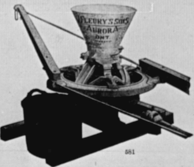
"Good Luck" Power with Grinder Attachment

As a power for driving any machinery with two or four horses the "GOOD LUCK" Triple Geared Power is unequalled. The above machine, set up with Arms and Tumbling Rod ready for horses and to drive another machine by rod direct, will be found one of the