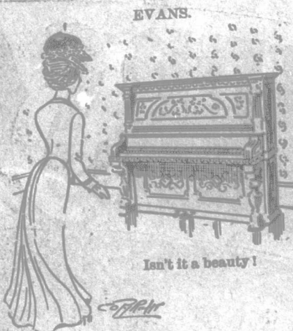
Isn't it a beauty!

ARE LEADERS IN THE NORTHWEST TERRITORIES.