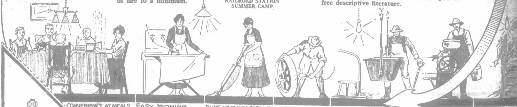
CONVENIENCE AT MEALS. EASY IRONING. RUNNING WATER. RUNS VACUUM CLEANER. LIGHT IN GARAGE. MAKES CHORES EASY. RUNS SEPARATOR. LIGHTS BARN.

Just write your name and address on the coupon provided and mail to our house nearest you for free descriptive literature.