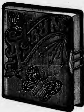
STYLE NO. 3.