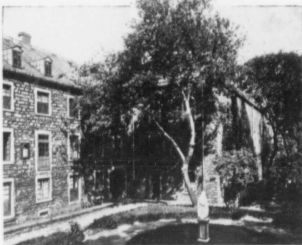
Nunnery of the Congrégation de Notre Dame.

to transfer his title to the new Company, subject to certain conditions anent the fur trade. The little band was received at Quebec with a studious courtesy that barely covered, however, a persistent antagonism on the part of the Jesuits, who had no desire to see the foundation of another order in the country of which they had grown to consider themselves the spiritual guardians. In spite of opposition from both the Church and the Governor, Montmagny, who