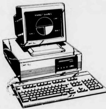
Z-286 AT-Compatible PC