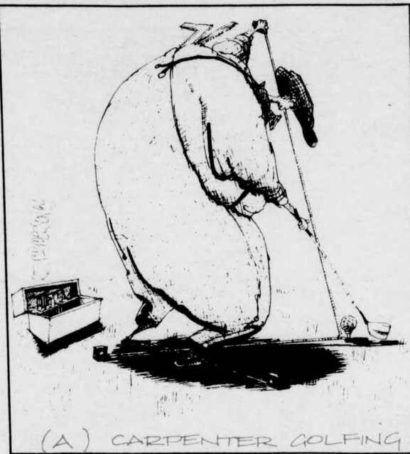
(A) CARPENTER GOLFING