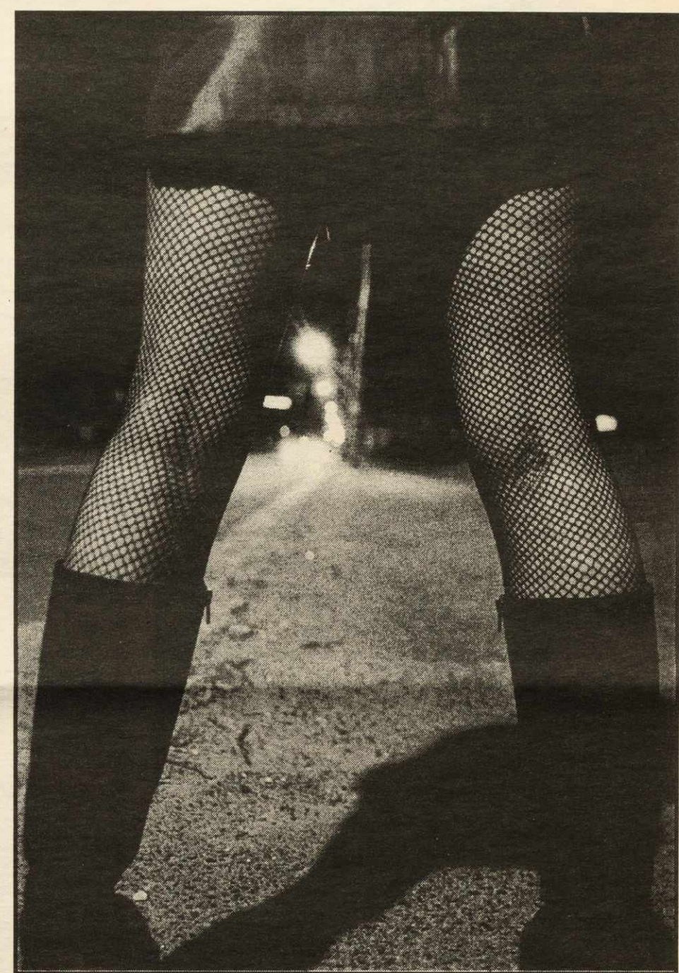
PROSTITUTION: Police sources say "a pimp is a pimp is a pimp", but what are the underlying differences between 'street-walkers' and 'escorts'?

violent crimes against prostitutes. In one of his articles he wrote, "this anti-prostitute rhetoric made it that much easier for sexual predators and other sexual misogynists to justify violence against street prostitutes."