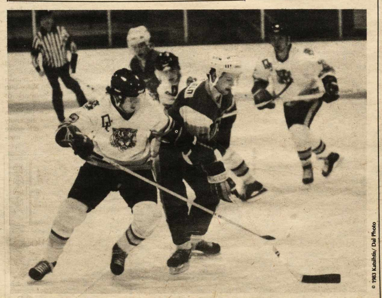
The men's hockey Tigers were 4-8-1 before last night's game with St. Mary's. Tigers lost a close one to UNB Friday, then drew 3-3 with Mt. Allison on Saturday.

If you want this dream and others write to your member of parliament.