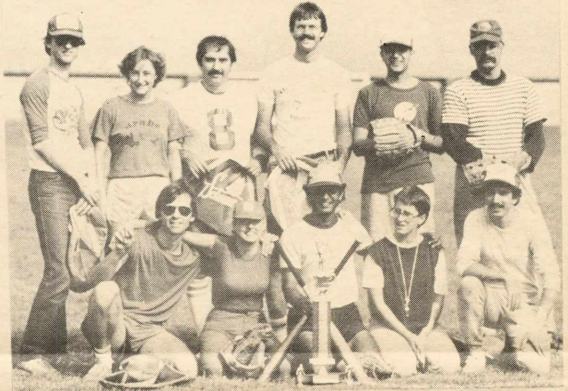
The grads are victorious.

The Tigers take on the Alumni Tuesday, September 20 at 7:00 p.m. in an exhibition match on Studley Field. Their next AUA contests are this weekend when Memorial University is in town for a pair of games Saturday and Sunday.