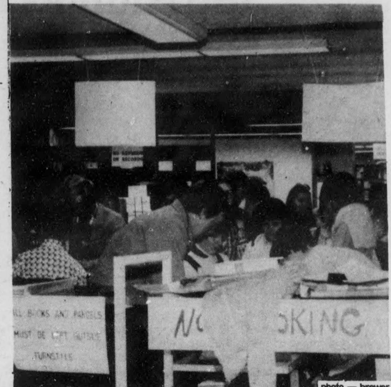
milling, searching, frustrated

Meanwhile, the long lines continue. Don't think of the chaos and noise as evil, but find beauty in the disorder and confusion of people.