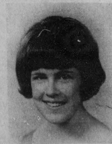
Rep. Sophomore; Manager of Girl's Intramural Sports; Forestry Queen.