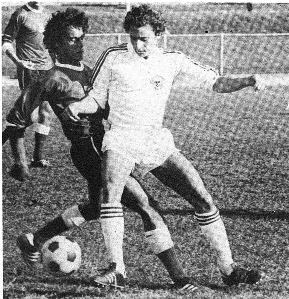
The U of A Golden Bears soccer team played well in their year of full schedule competition.