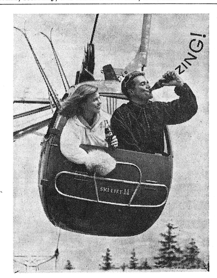
Only Coca-Cola gives you that