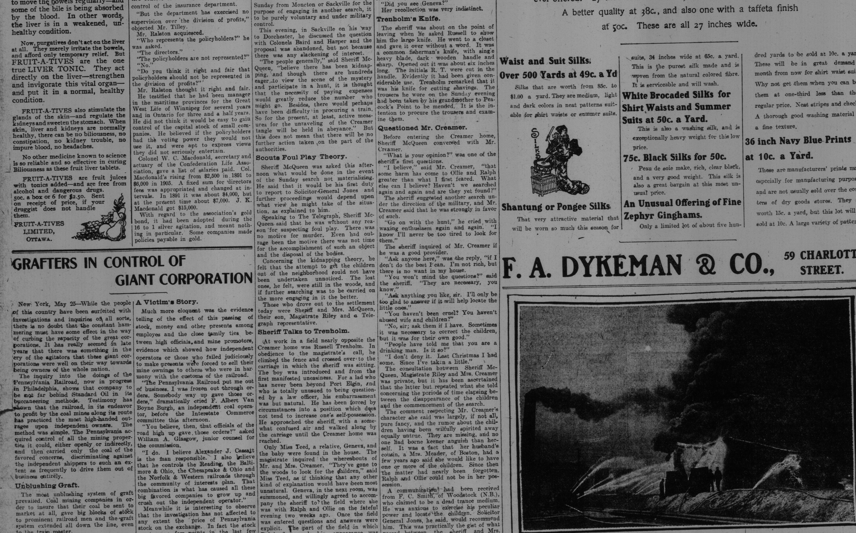
Burning of the Oil Tank in the Standard Oil Works Dayonne NI

These are manufacturers' prints made especially for manufacturing purposes, and are not usually sold over the counworth 15c. a yard, but this lot will be sold at 10c. A large variety of patterns.