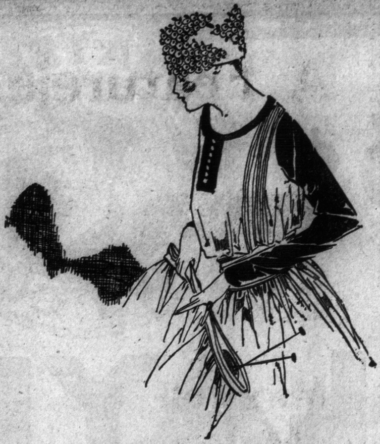
UNUSUAL BLACK AND WHITE COMBINATION In a pretty waist of georgette. The neck fixings and sleeves are of soft black satin and it is trimmed with tucks and white pearl buttons.

Returned Toronto Soldier Had Forgiven Her Fault Once Before.