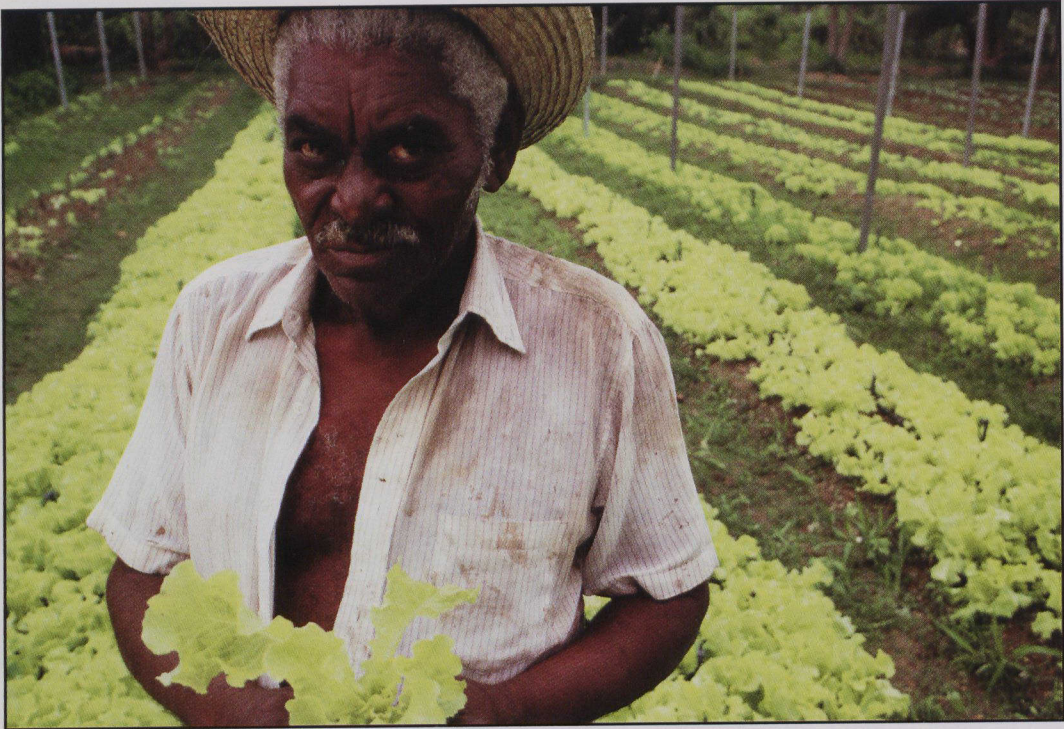
Worker at ACTAF demonstration farm, 2003