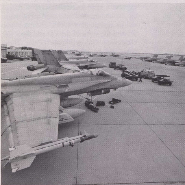
As part of the UN arms register, countries are asked to report exports and imports of seven categories of weapons, including combat aircraft such as the Canadian CF-18 fighter jets pictured above at their base in Qatar during the Gulf War.

A Canadian arms control initiative achieved a major success on December 9 when the UN General Assembly (UNGA) adopted a resolution establishing a global arms register. The resolution passed by an overwhelming 150 in favour, none opposed and two abstentions (Cuba and Iraq). China, Djibouti, Laos, Myanmar, Sudan, Syria and Vietnam did not participate in the