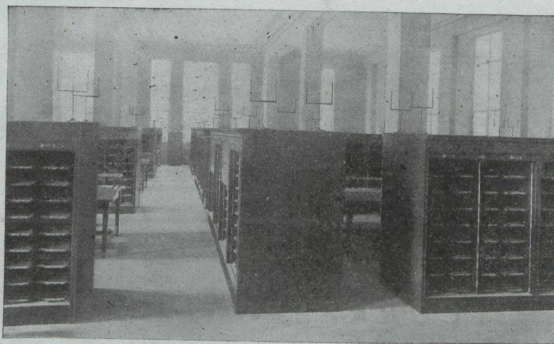
This interior view showing part of the "Office Specialty" Steel installation in Toronto Registry Office, shows a wide variety of equipment in use. Stacks with roller shelves for books (in front of which are Sliding Curtains);

Reference Tables, Trucks, and Document Files.