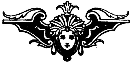
Sign of the Four Dials