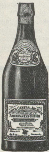
FAC-SIMILE OF WHITE LABEL ALE