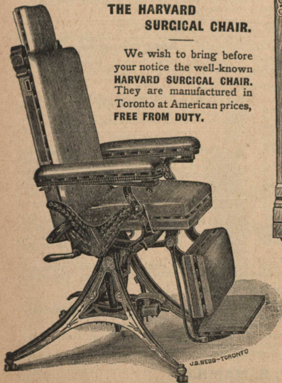
The Harvard in the upright position with head rest folded back.

We wish to bring before your notice the well-known HARVARD SURGICAL CHAIR. They are manufactured in Toronto at American prices, FREE FROM DUTY.