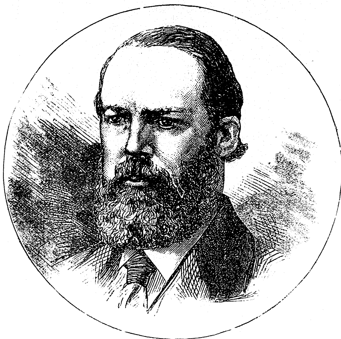
HON. W. H. ENGLISH, DEMOCRATIC CANDIDATE FOR THE PRESIDENCY OF THE UNITED STATES.