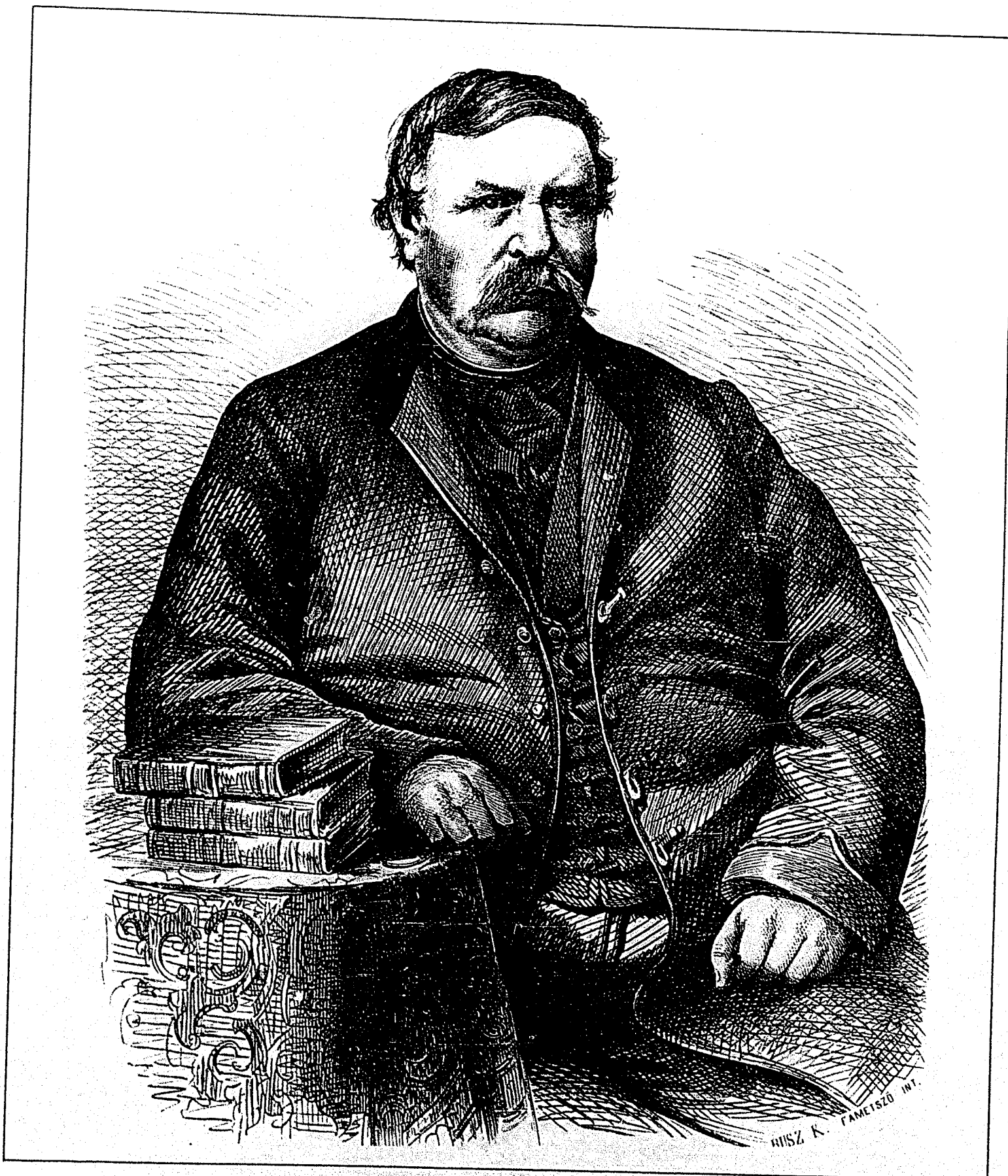
THE LATE FRANCIS DEAK, THE EMINENT HUNGARIAN STATESMAN.