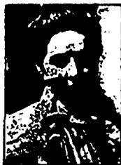
Trade Mark Registered.

The Royal Victoria College has just been supplied with a very fine Evans Bros. Cabinet Grand Piano from Layton Bros.' new warerooms, 144 Peel street. This instrument is for use in the Lecture Room, and is in keeping with the other elegant furnishings of this grand institution.