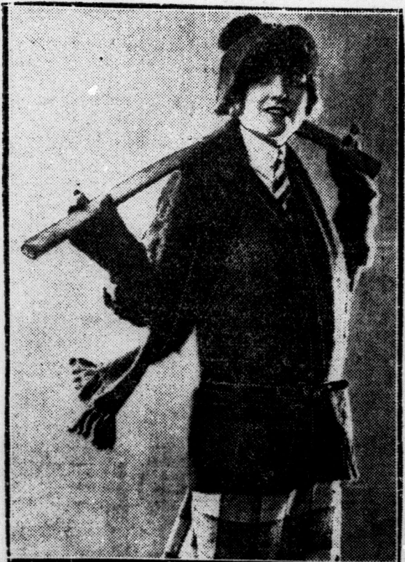
A two-tone wool sweater worn with wool cap, scarf and gloves.