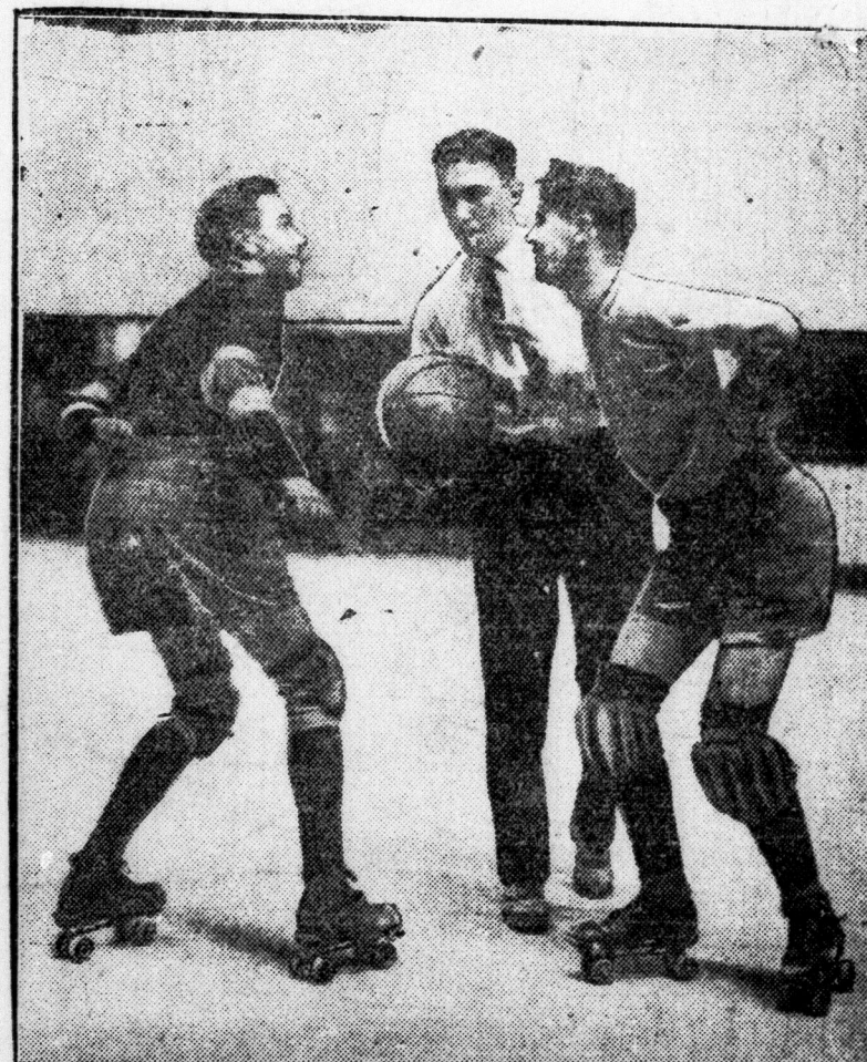
They had a basket ball game on roller skates in Philadelphia the other night.