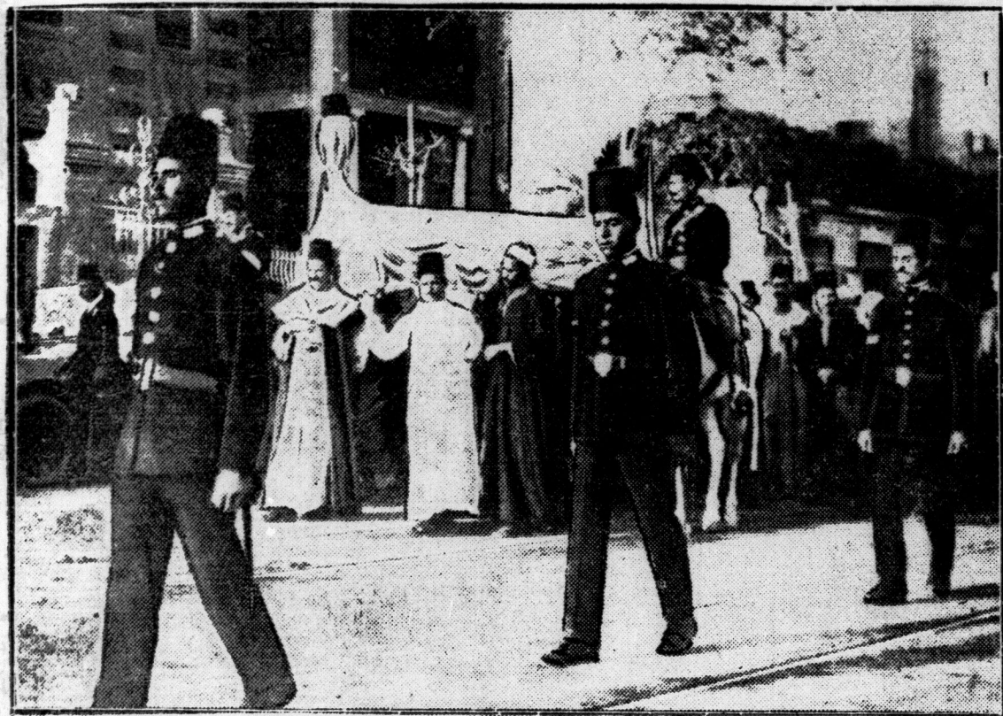
Funeral procession in Cairo of Ismail Bey Zuhdy, an Egyptian nationalist killed in the recent riots.