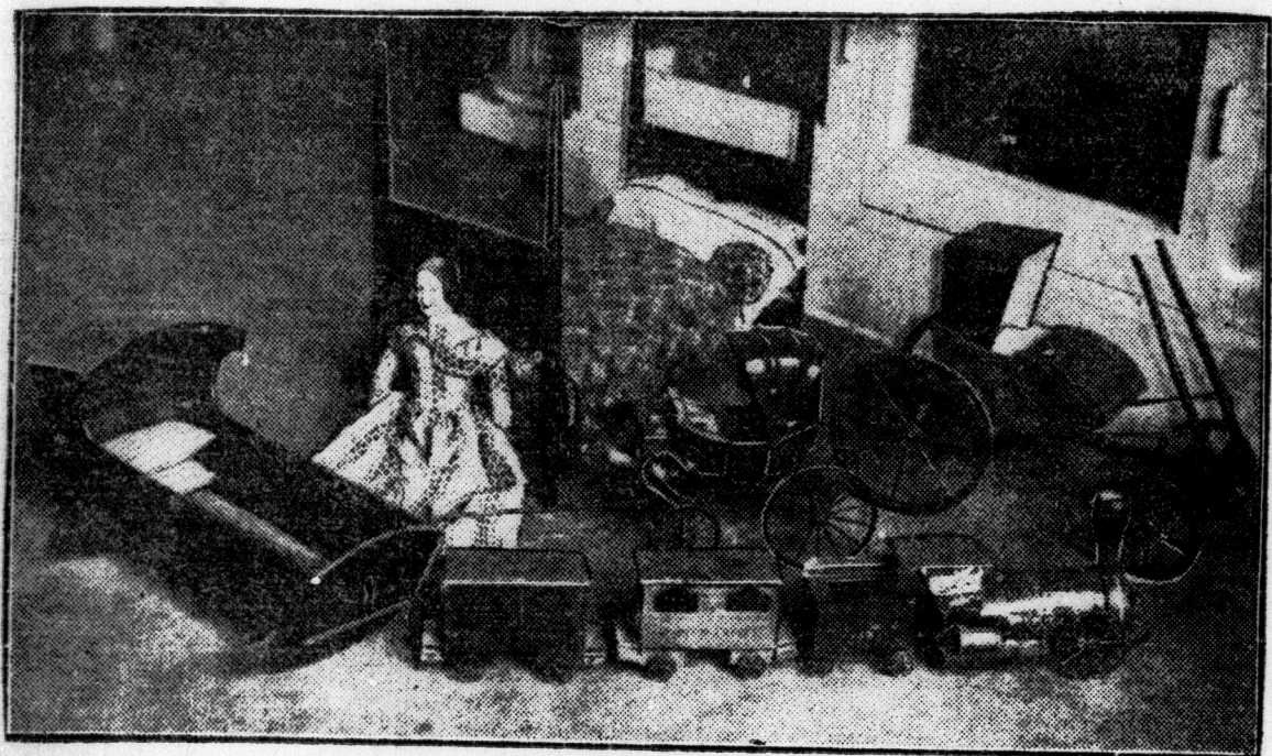
Old-fashioned toys in a corner of the Essex Museum in Salem, Massachusetts.