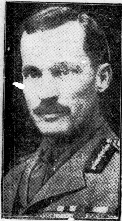
Brigadier-General Sir Gilbert Clayton, who has accepted the post of chief secretary to the Palestine government, succeeding Sir Wyndham Deedes.