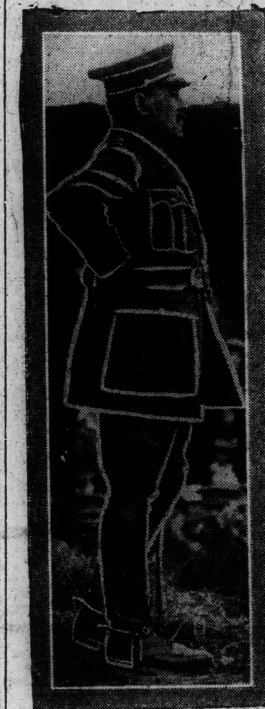
SIR WM. ROBERTSON ADDRESSING VILLAGE CROWDS. Gen. Sir William Robertson, Chief of British Army Staff, delivered an important speech in unveiling a village cross at Bachelary, England, for securing the greatest percentage of enlistments. With about 800 inhabitants, 72 per cent. have enlisted.