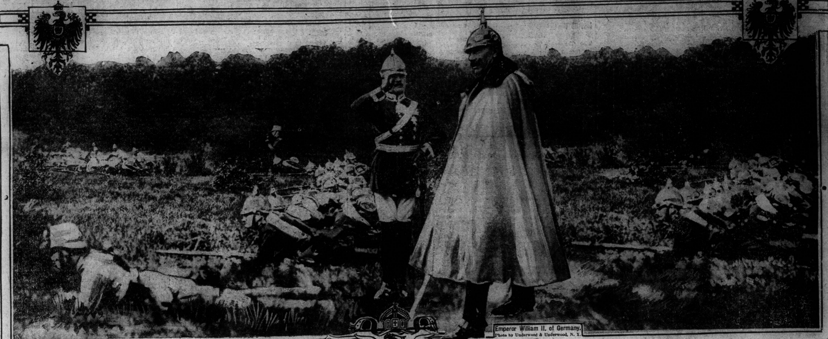
Emperor William II. of Germany.