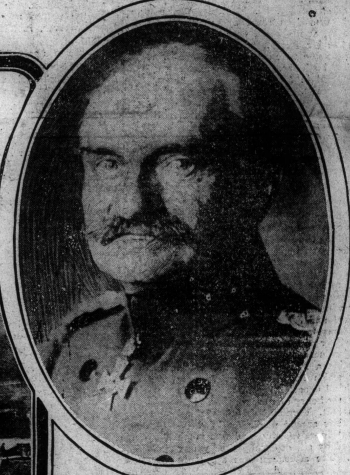
General Von Below, Commander of the Twenty-First Corps, Saarbrücken, German Army Strategist.