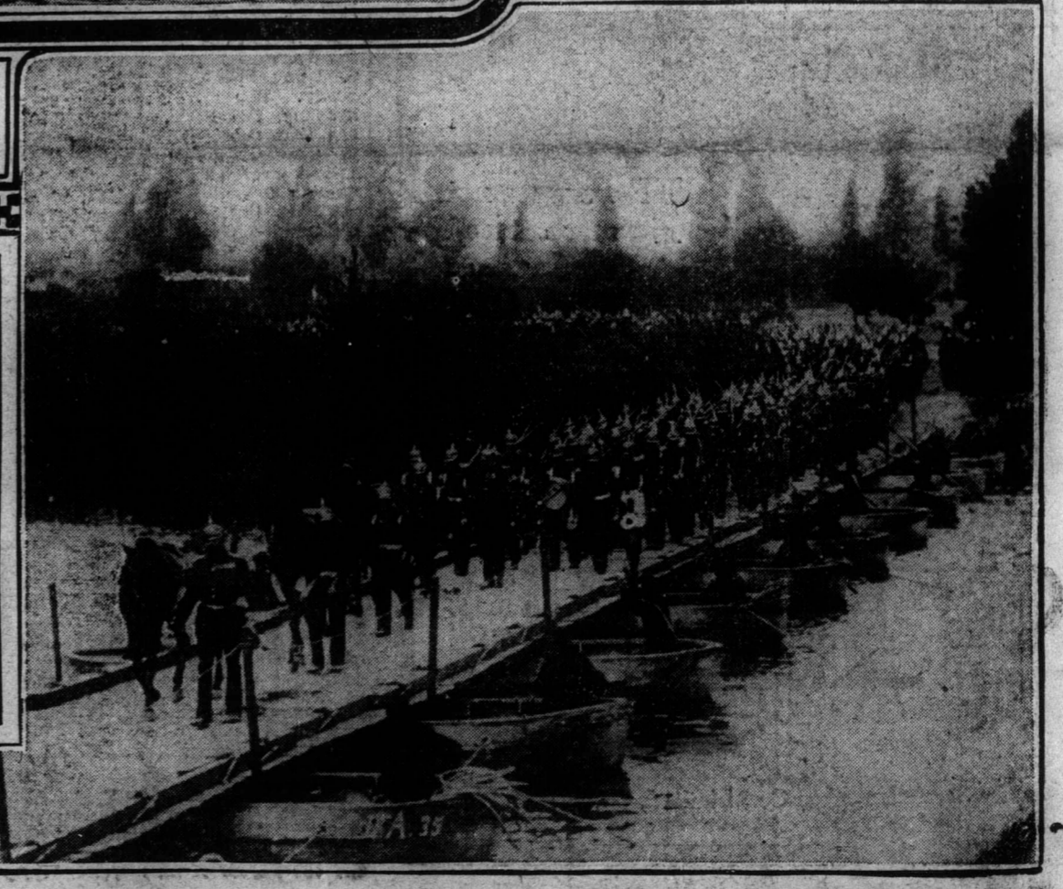
German Engineers Crossing Bridge of Their Own Construction.