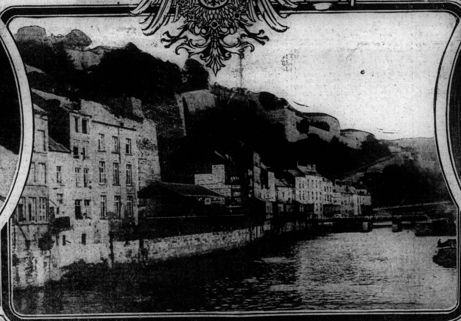
Namur, Belgium, a Pivotal Point in the German Advance.