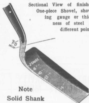
Sectional View of finished One-piece Shovel, showing gauge or thickness of steel at different points

CANADIAN SHOVEL & TOOL CO. WRITE FOR CATALOGUE LIMITED HAMILTON, CANADA