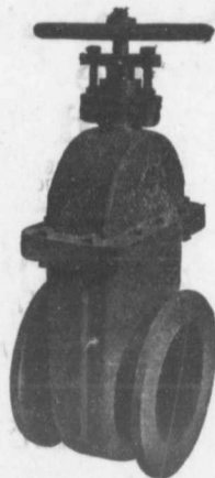
Flanged End Gate Valve with Hand-Wheel.