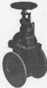
Indicator Gate Valve.

Railway Supplies, Structural and Ornamental Iron Work