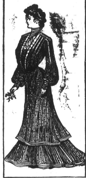
GOWN OF DOTTED VEILING.

The prevailing styles tend toward the Louis XVI. order with draped founces