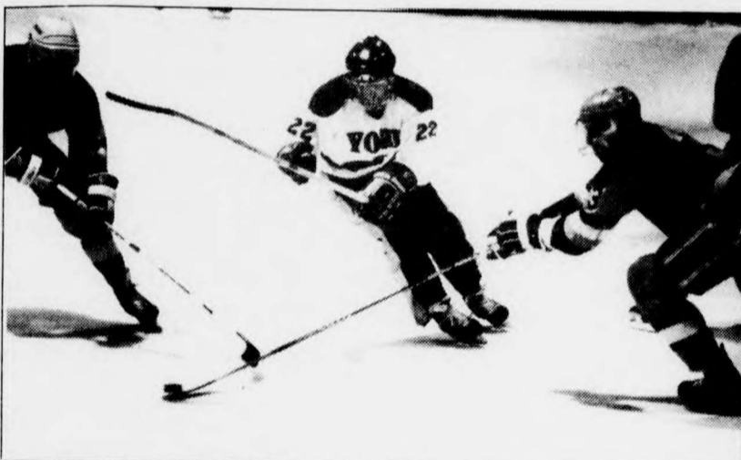
GOLDEN DAYS OVER? Wilfrid Laurier, with an I, upset the Yeomen 6-1 at the Ice Palace Thursday night. The Yeomen face a major test tonight, when undefeated Western comes to town.