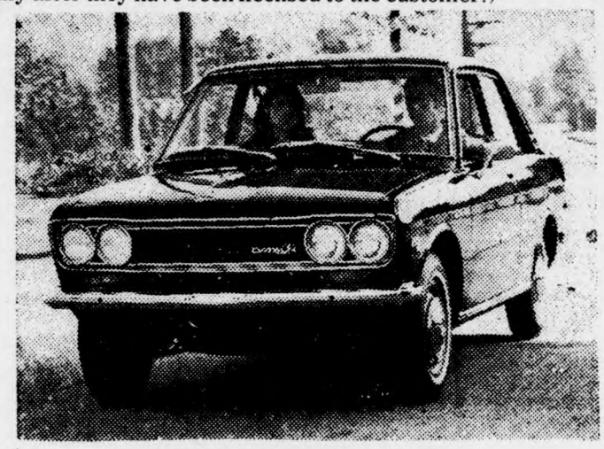
Meet the new leader — Datsun How they scored across Canada in August

Datsun emerged as the best-selling import car in Canada in August, according to figures just released by R.L. Polk & Co. (This, by the way, is the company that keeps the manufacturers honest as far as sales claims are concerned. Polk counts new cars as sales only after they have been licensed to the customer.)