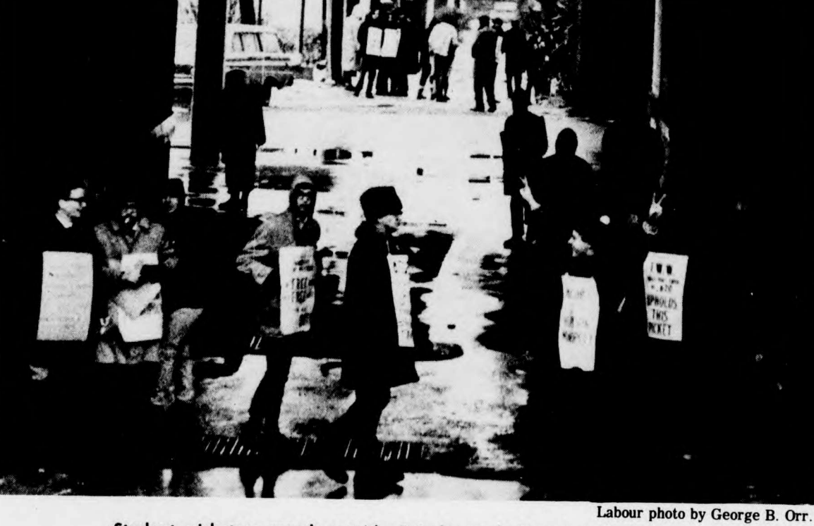
Student picketers march outside Peterborough Examiner building.