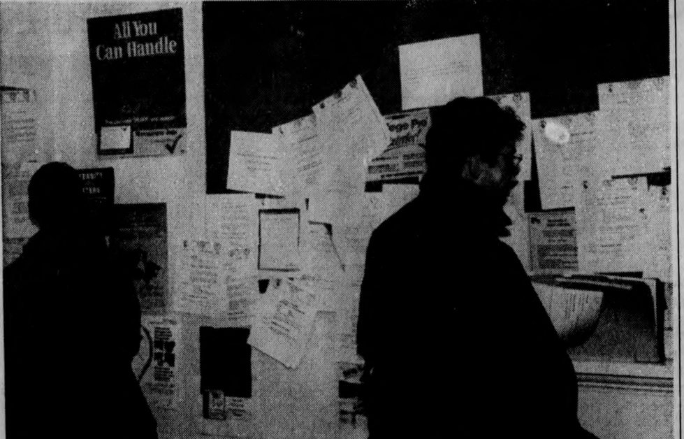
Two students examine the job board. Many more will come, and some will find gainful employment for the summer.

An increase in the number of job postings in recent months has left the Manager of UNB's Student Placement Service feeling cautiously optimistic about student summer employment